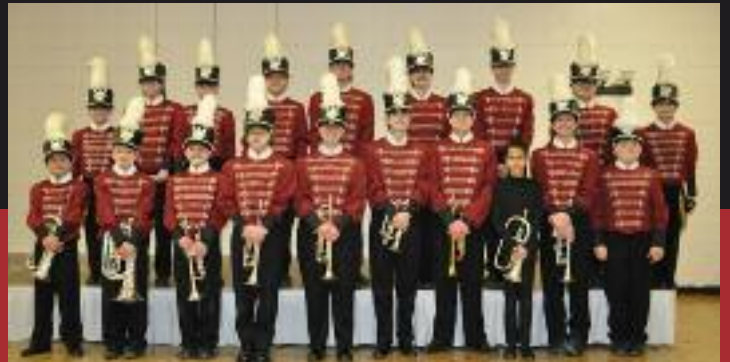
Preston Scout House Cadets