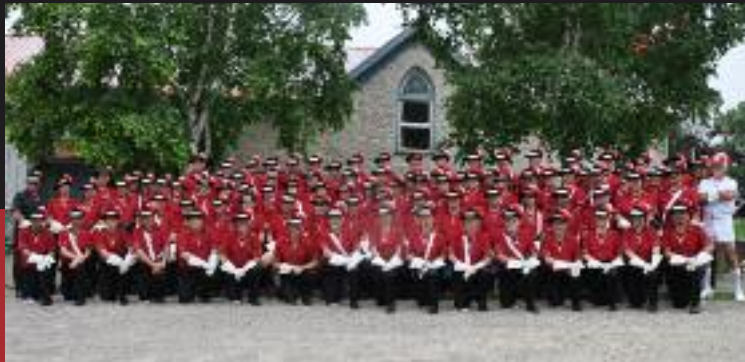
Preston Scout House Band